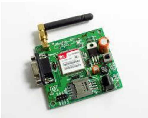
Figure.3. GSM Board

3. GPS: GPS receiver provides a solution that is high in position and speed accuracy performances, with high sensitivity and tracking capabilities in urban conditions. This module shown in figure.4 delivers major advancements in GPS performances, accuracy, integration, computing power and flexibility. The general specification of the module is given below: