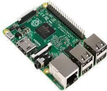
Figure.2. Raspberry pi 3

2. GSM (900A): Global System for mobile communication is a standard developed by the European Telecommunications Standards Institute (ETSI). The GSM module used in this project is SIM900A which offers all features mentioned above and serves as a medium between transmitter and receiver. GSM board shown in figure.3 receives a latitude and longitude values of the exact position of the child and send this to receiver.