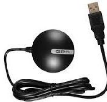
Figure.4. GPS Board

4. Push Button: Whenever the child feels that he is in danger, he presses the push button. By pressing the push button the message get forwarded to parents mobile and detects the location of child and send it as text message to parents mobile.