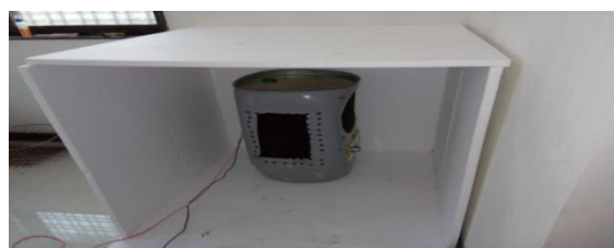
Figure.2. Thermocol Room

In this project, we have designed a small model of cooler. So, instead of considering the room area first, directly a small model of direct evaporative cooler is designed and developed by making some design considerations for finding out the capacity of fan to be used in the desired model. And finally according to the size of the developed model, a room of thermocol is prepared which is having a size slightly larger than that of the model of the cooler. All the readings of the developed model of the cooler is taken inside the thermocol room prepared, in order to analyse the cooling effect of the cooler properly.