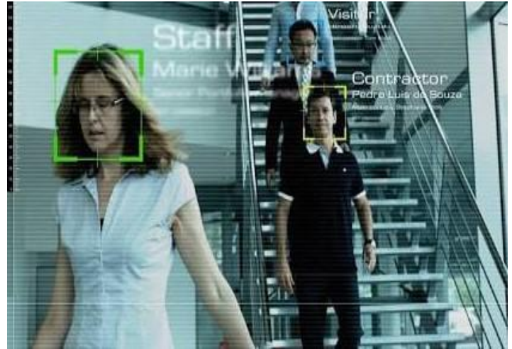
Figure .3. Expressing farcical moments

through video frames to extract the right moment for the required content [5].