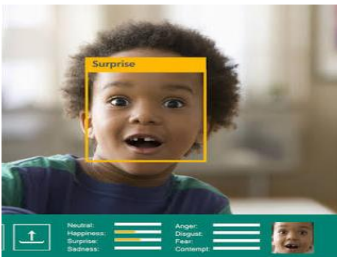
Figure.2. Emotion API

Microsoft Emotion API helps in building applications which recognizes feelings, responds to various moods on the human face, and helps in getting closer to the user. This cloud based API helps in building personalized applications with edge-cloud based emotion recognition algorithm. This API, using the face based attributes, can detect happiness, sadness, anger, fear, and surprise. The algorithms used in this API detect the emotions according to universal facial expressions [7].