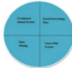
Figure.1. Components of Alumni System

It could serve as a platform for current students to interact with their senior alumni and receive mentoring from them with regards to career paths, real world expectations and so on. There are different stake-holders in the system, ranging from the alumni who have studied in the university to visitors or prospective students who want to know more about the university. All members in the system will be divided into four main categories: university, alumni, current students, and faculty and along with the administrators. Each of the members will have some features, which are specific to their individual group (of users) and some general features which tend to be common to all users.