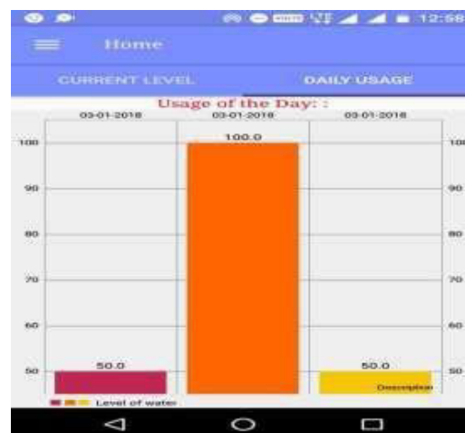
Figure.5. Daily Usage (Represented in Bar Chart)