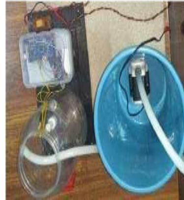
Figure. 3. Hardware Setup