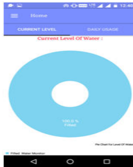
Figure.4. Current Level of Water