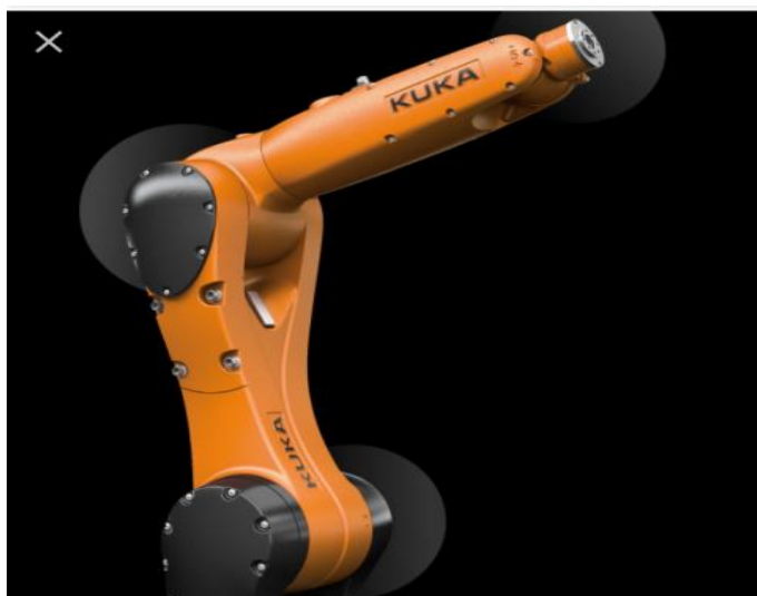
Figure.1. Kuka robotic arm

A robotic arm is a type of mechanical arm, usually programmable, with functions homologous to a human arm. The most common manufacturing robot is the robotic arm. A typical robotic arm is made up of seven metal segments, joined by six joints. The computer controls the robot by rotating individual step motors connected to each joint. An industrial robotic arm is used for welding, painting, assembly, pick and place for printed circuit boards, packaging and labeling, palletizing, product inspection, and testing; all accomplished with high endurance, speed, and precision KUKA configuration for robotic arm which is cylindrical and have two parallel joints will be designed and simulated using CATIA which is latest design software for assembly and simulation of machine parts.