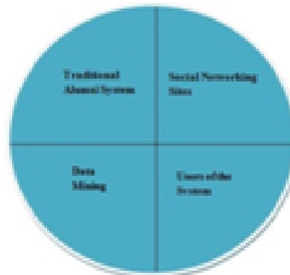
Figure.1. Components of Alumni System

There are different stake-holders in the system, ranging from the alumni who have studied in the university to visitors or prospective students who want to know more about the university. All members in the system will be divided into four main categories: university, alumni, current students, and faculty and along with the administrators. Each of the members will have some features, which are specific to their individual group (of users) and some general features which tend to be common to all users.