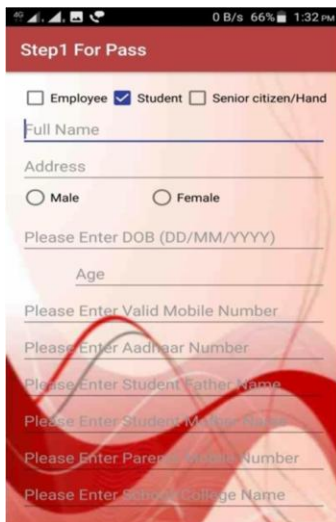
Figure .2. Pass Registration Screen

Figure 1 shows the profile of the user. User can apply for the pass, can view the bus routes and timings, and also can see the pass after the successful registration for pass. Also you can Sign Out from this page.