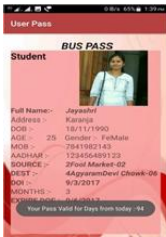
Figure .3. Generated Pass

Figure 2 is all about the application form of pass. In this screen, you will have to fill all the details asked about and then system will let you go to next step.